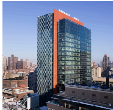
Zuckerman Research Center 417 East 68th Street

This symposium will be offered in a hybrid format , with in-person participation at MSK's Zuckerman Research Center in New York City and a virtual participation option available via Zoom.