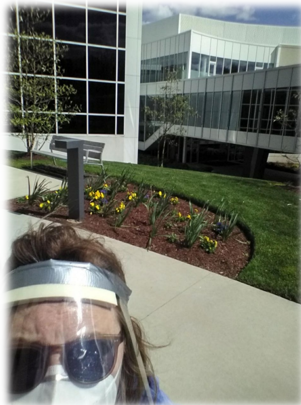
Home-made face shield! duct tape, presentation velo-cover & foam