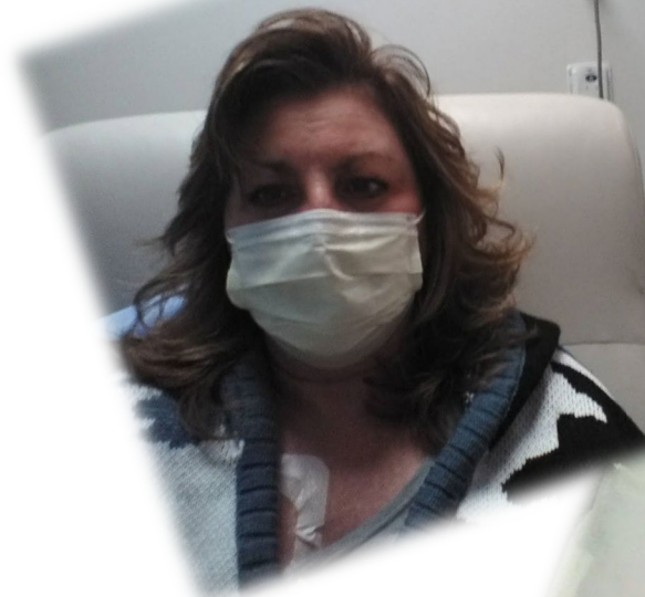
Receiving treatment & Surgery - Solo!