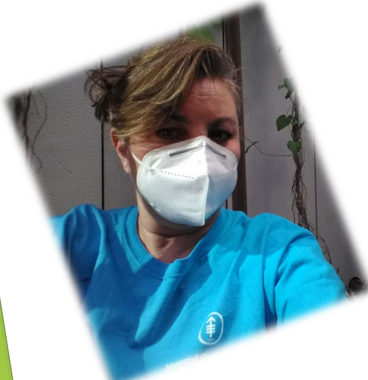
Waiting in the outdoor garden