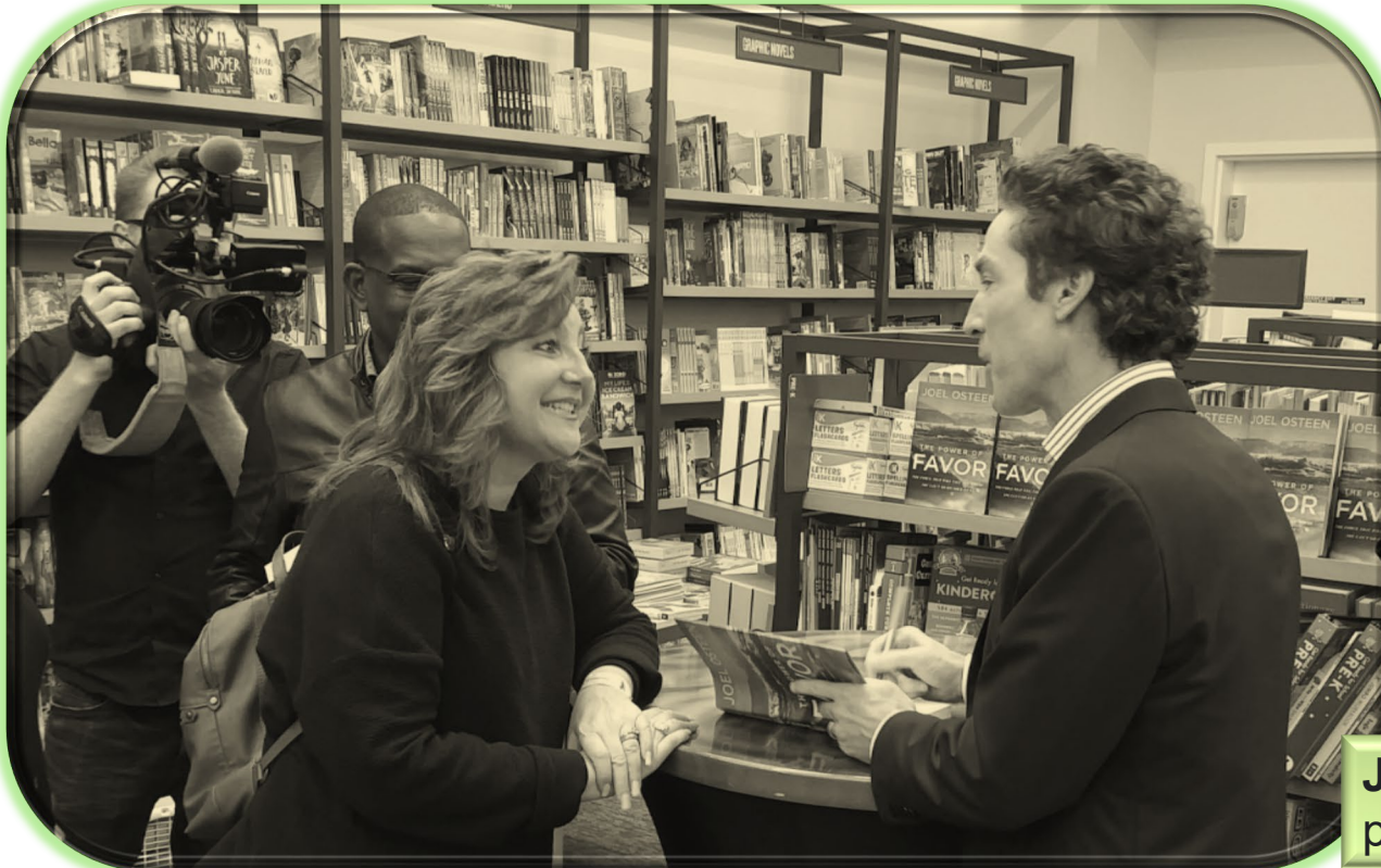
Joel Osteen; pastor, televangelist, and author